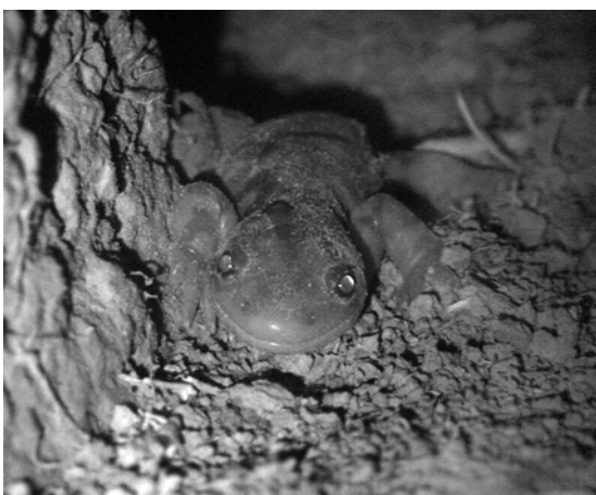
Figure 6. Tiger salamanders reside in prairie dog burrows in the vicinity of a small wetland within one of the treatment areas at Wind Cave. Staff, therefore, decided not to treat 100 acres in this area in order to create a refugium for the species.

Yersinia pestis is an exotic bacterium, and therefore its control and eradication would be supported by NPS management policies. However, eliminating the disease from North America, let alone the 25 or so units of the National Park System that host it, is