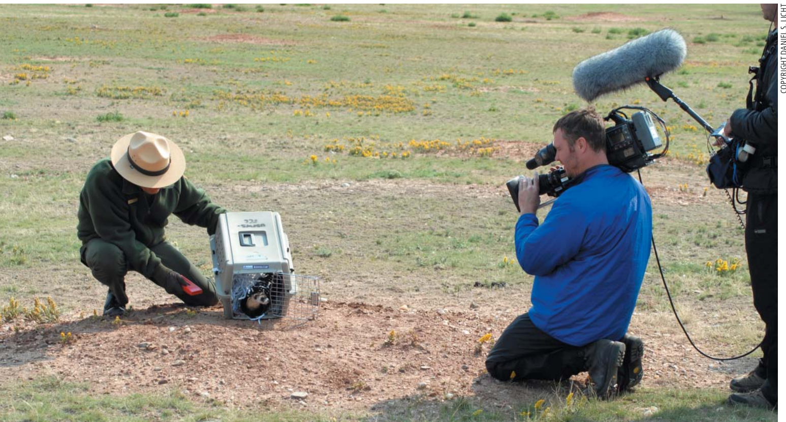
<sup>2</sup>An outbreak of disease in wildlife.

Figure 2. A television crew films the release of a black-footed ferret in Wind Cave National Park. An outbreak of plague could jeopardize restoration of this endangered species, which relies on prairie dogs for food and shelter.